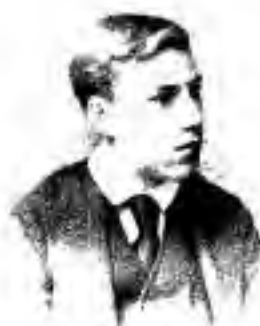
CECIL SHARP AS A BOY